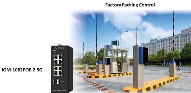
Built-in SFP for long distance transition

Extend the network further with the 2.5G SFP slots. The SFP ports also supports DDM which offers more information about the fiber connection and makes it easier to find any faults or bad connections.